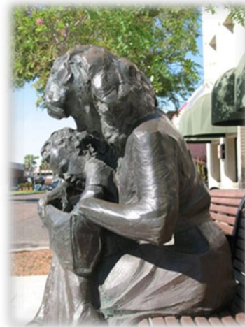
City of Escondido Planning Division 201 N. Broadway Escondido, CA 92025 (760) 839-4671